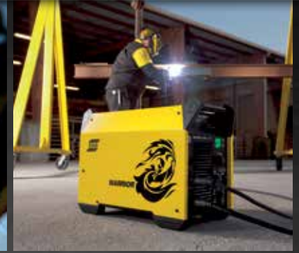
WARRIOR™ 500i CC/CV