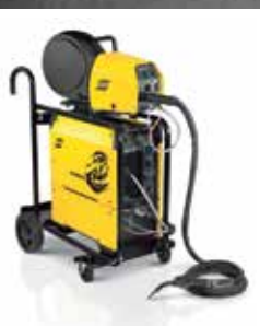
Part No.: 0465 427 880 NOTE: Part No relates to cool unit ONLY