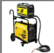
Part No.: 0445 800 883

The most durable and reliable combination for heavyduty MIG/MAG welding with Stick (MMA), TIG (GTAW), and gouging capabilities.