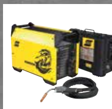
Part No.: 0558 102 222

Portable, durable wire feeder with the most advanced features to meet today's welding requirements.