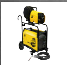
Part No.: 0465 250 881

The new user friendly and robust feeder.