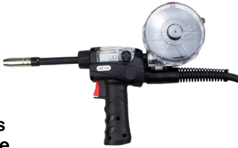
Spool Gun (K69083-1)