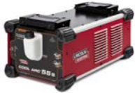
Shown: Cool Arc 55 S

Accessory Kit Complete kit for stick welding. Includes 30 ft. (9.1 m) electrode cable, 25 ft. (7.6 m) work cable, headshield, work clamp and electrode holder. 150 amps. Order K704