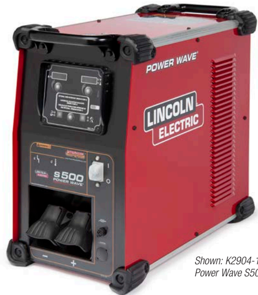
Shown: K2904-1 Power Wave S500