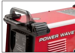
Reversible handles shown