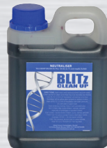
Neutraliser MST128 MST129