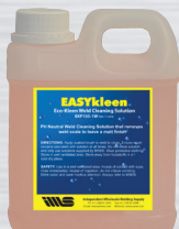
Eco-Kleen PH Neutral EKP103-1 EKP103-5 EKP103-20