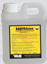
EKP-50 EKP102-1 EKP102-5 EKP102-20