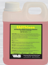
All Machine Solution EKP104-1 EKP104-5 EKP104-20