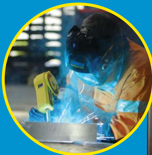
Optional SGT250 Spool Gun ideal for your precision aluminium fabrication, repairs and auto/marine work.