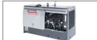
Single-side engine access with lockable sliding door.