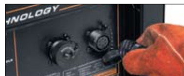
Output automatically switches to remote mode when remote device is connected.