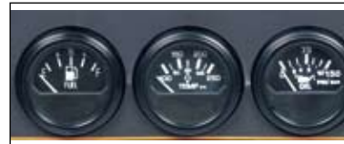
Fuel, Oil Pressure and Engine Temperature gauges help you monitor performance.