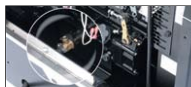
Handy oil drain valve and tube makes oil changes easy.