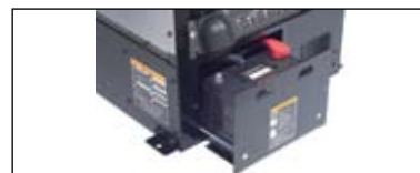
Convenient slide-out battery drawer below control panel.