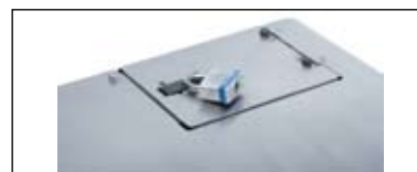
Patent-pending latched and lockable radiator cap cover.